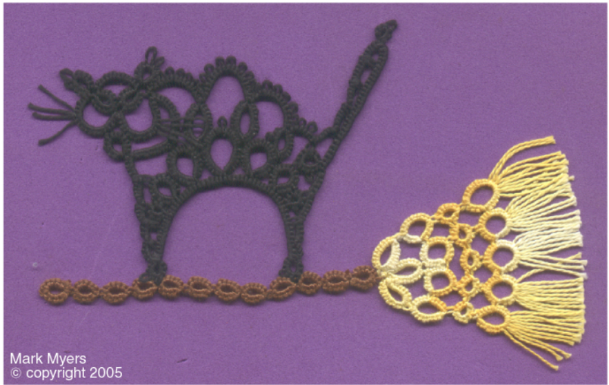
Mark Myers © copyright 2005